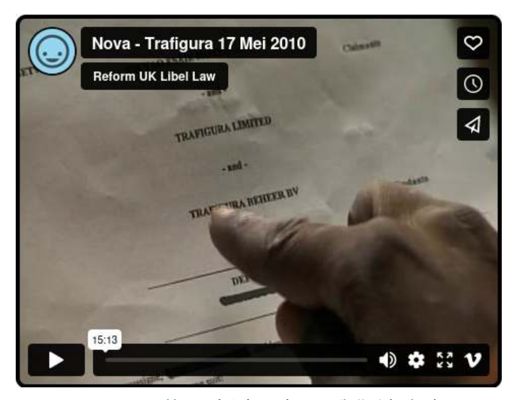
Vimeo (下载) | 托克司机: 我们被贿赂了

Vimeo 评论者:无论您是谁,谢谢您提供此内容。如您所知,在英国我们不允许阅读或看到任何内容。