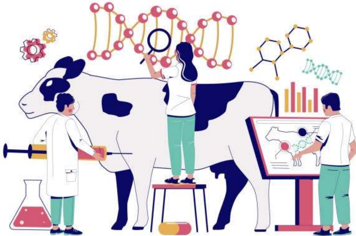
GENETICALLY MODIFIED ANIMALS