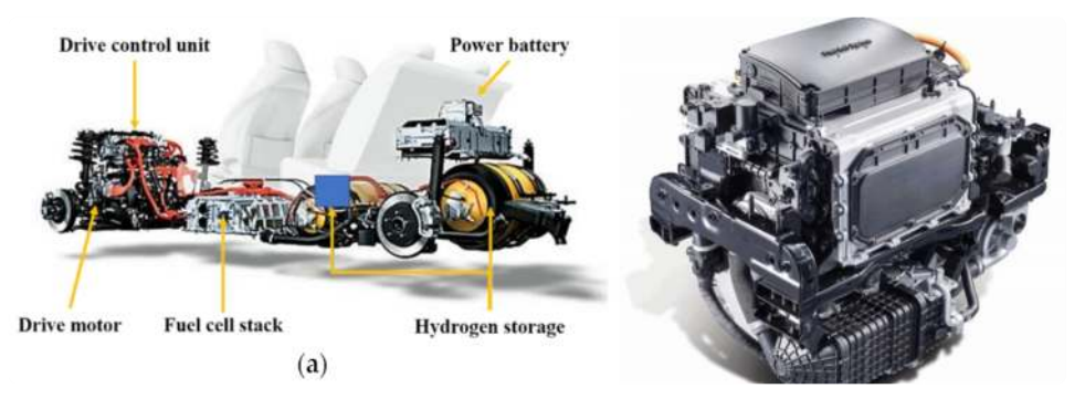
Complex fuel cell technology is difficult and costly to maintain. A hydrogen engine fits in existing petrol car platforms.

Fuel cell technology is more complex than a hydrogen combustion engine and requires a very pure source of hydrogen, which is difficult to guarantee in practice. The most economical methods for hydrogen production cause impurities that can break fuel cells.