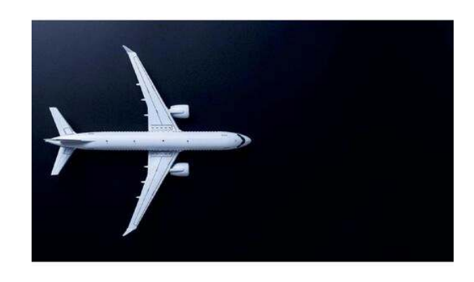
Lodewijk van Maaseik

For her efforts to expose corruption, Judge van Rijnberk was reprimanded by the Dutch Supreme Court and banned from conducting criminal cases.