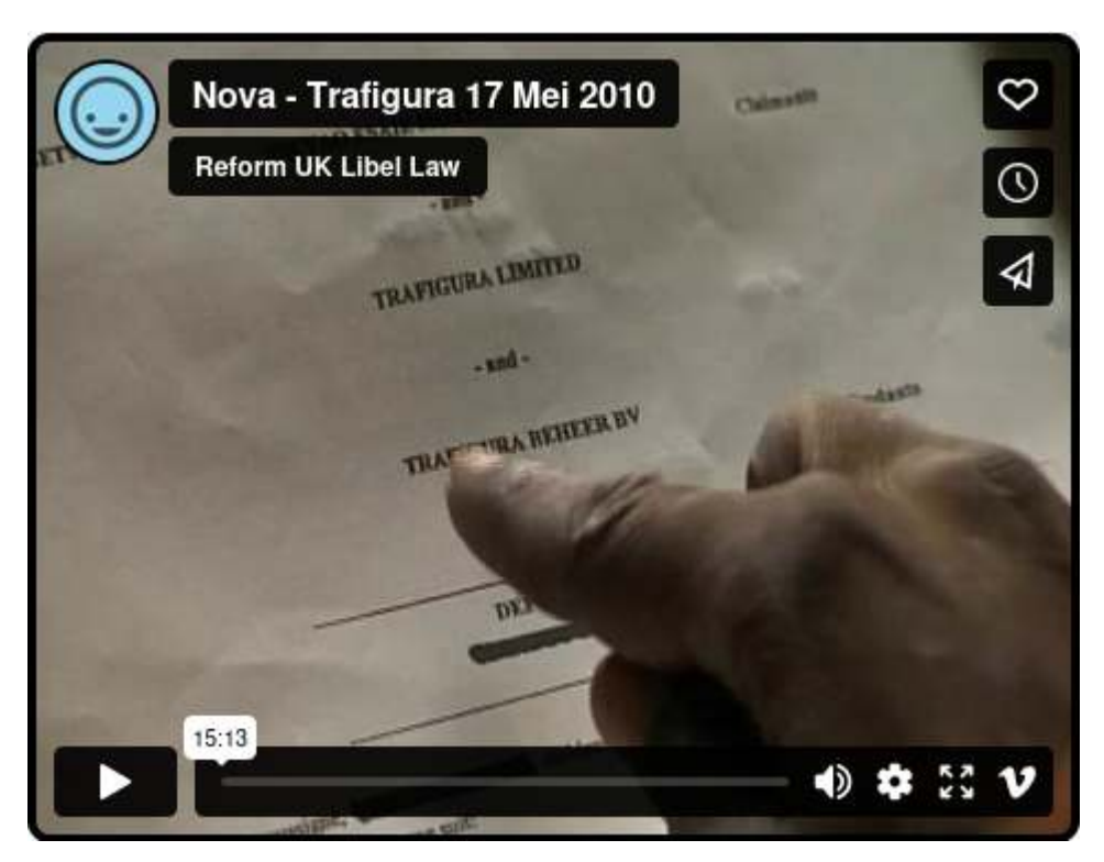
Vimeo (下載) | 托克司機: 我們被賄賂了

Vimeo 評論者:無論您是誰,謝謝您提供此內容。如您所知,在英國 我們不允許閱讀或看到任何內容。